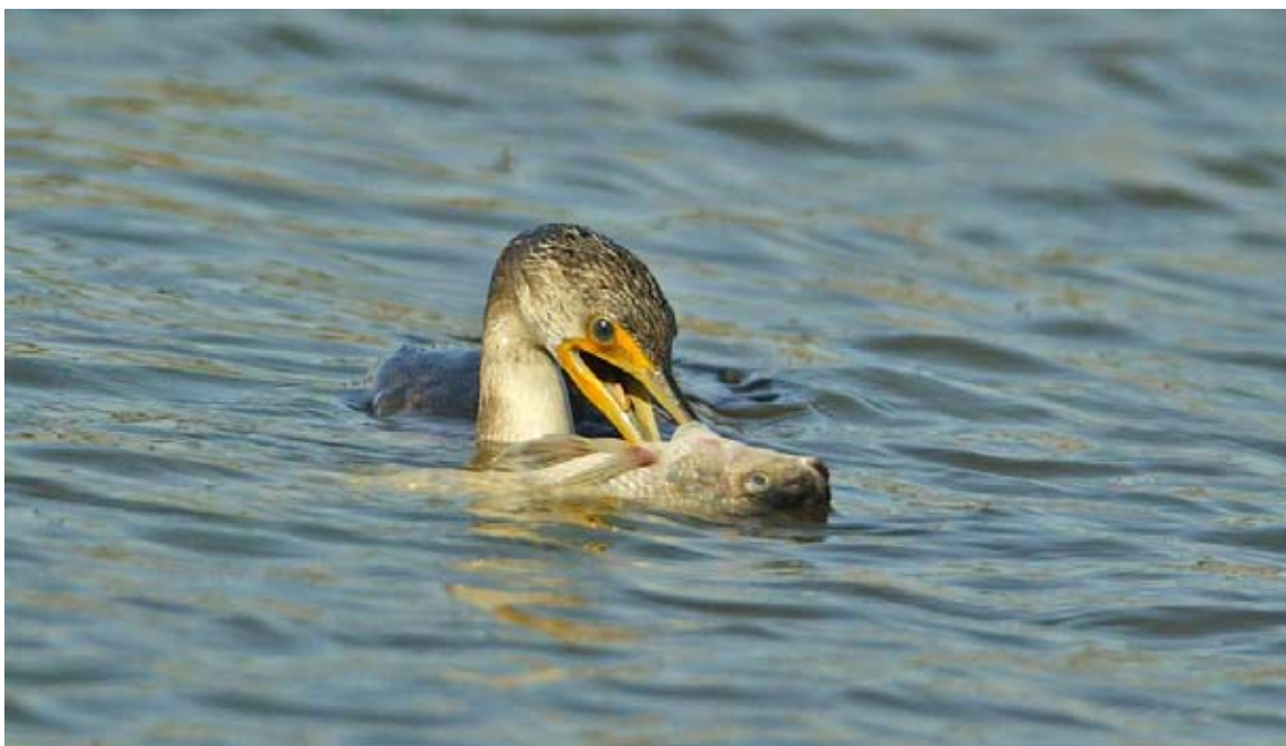
Figure 5. On this juvenile Double-crested Cormorant note the bare skin and color of the supra-loral and the pale throat and upper breast.